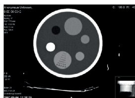
X-ray and MRI transparent

Maximum shrinkage on length: 1% Maximum shrinkage on width: 3% Approved according to European Standard EN 1865 and EN 1789